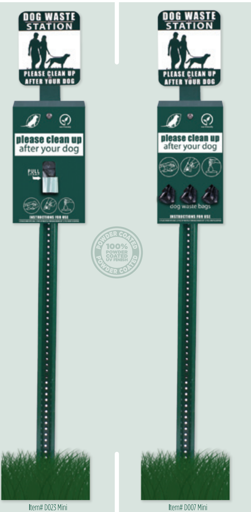
Item# D023 Mini

ALL ALUMINUM • SCREENED SIGNAGE • LIFETIME WARRANTY